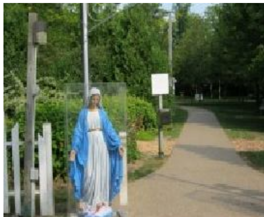
Entrance to Our Lady of the Rosary Shrine