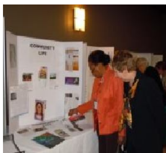
Studying Standing Committee Display Boards – a great learning experience.