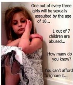
One in three poster Awareness Campaign in the battle against human trafficking

We are very blessed to have had a large contingent of ladies from the London Diocese attending both the Ontario Provincial Convention and the National Convention. They have returned to us excited to start on new initiatives, and to share all the memories with everyone. This is truly how the "fire" is lit and we look forward to the adding fuel in the programs we have planned for the convention in 2013 (taking place at "The Arden", Stratford, ON).