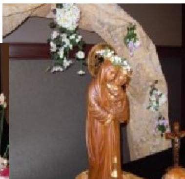
Madonna statue 2012 Convention