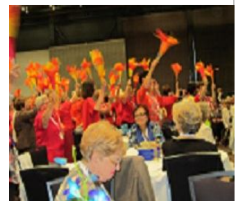
Catch the Fire trainees fan the flame as the new program is introduced

sisterhood and helps us to experience the joy of being a League member. The program will run for the next two years.