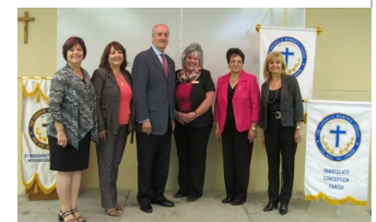
Members from the three councils meeting with Honourable Julian Fantino, MP Vaughan