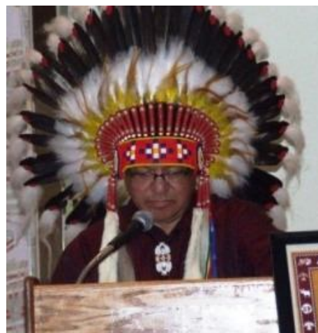
Grand Chief Yesno addresses delegates.