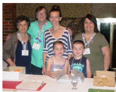
Registration Table hard at work.