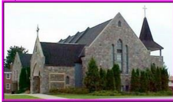
Holy Name of Jesus

Thoughts and prayers from all members across Ontario As you celebrate this awesome milestone