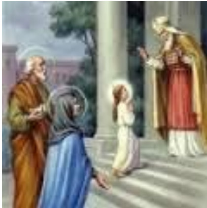
November 21 Presentation of Mary

James tells us that Anna and Joachim offered Mary to God in the Temple when she was 3 years old. This was to carry out a promise made to God when Anna was still childless.