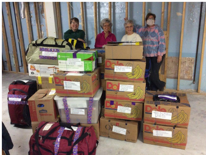
Pictured are members of Cochrane's, Our Lady of Fatima CWL, sorting and boxing supplies to be sent by train. They will then be delivered by ice roads to Fort Albany.