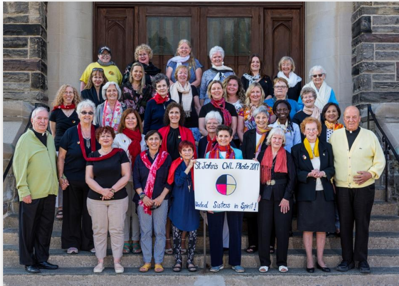
Members and Clergy of St. John Parish Council

The Council embraced the theme " Care for our Common Home ". They had many activities this passing year. They explored the importance of water conservation and preservation pledging to care daily for water and thereby protect and cherish creation. They welcomed beekeepers to speak about the importance of bees to all planet life. They acted on the theme of Loneliness/ Homelessness with their monthly casseroles feeding the homeless, providing hygiene items to a women's shelter and arranging a community Healing Mass.