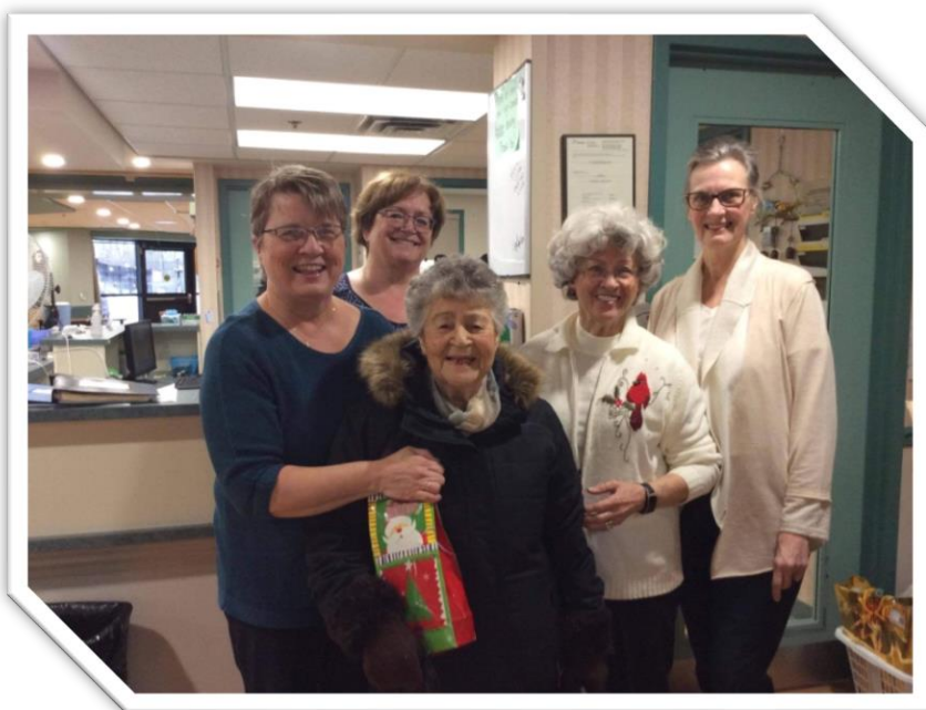
Our Lady of Fatima Parish Council, Cochrane were active prior to COVID-19. CWL members delivered gifts to Villa Minto Long Term Care in January 2020. It brought joy and surprise to the residents following the Christmas season.