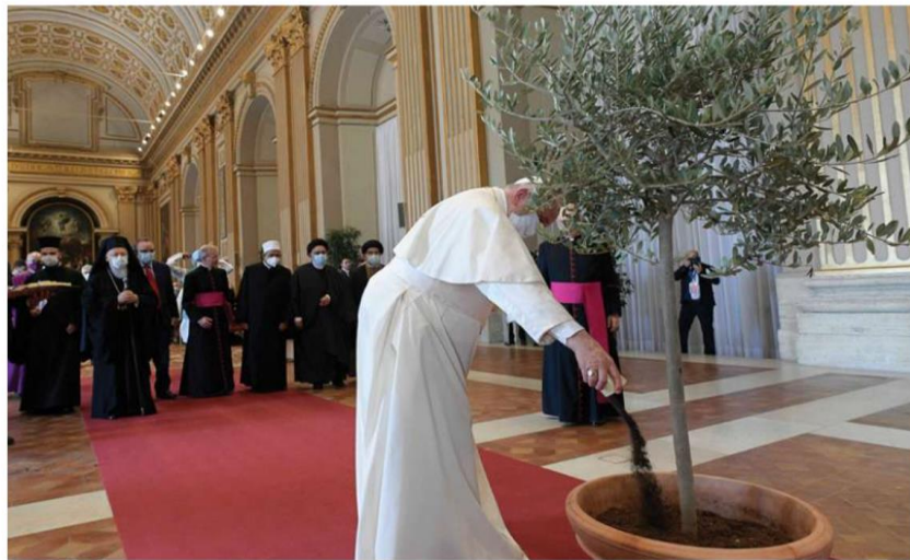
Pope Francis pours dirt into a potted olive tree during the meeting, "Faith and Science: Towards COP26," with religious leaders in the Hall of Benedictions at the Vatican Oct. 4. The meeting was part of the run-up to the UN Climate Change Conference in Glasgow Oct. 31-Nov. 12.