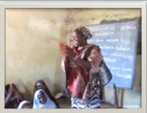
Women are receiving training on using alternative energy.